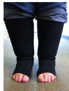
After Therapy – and different shoes now required!