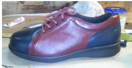
6 eyelets to 4