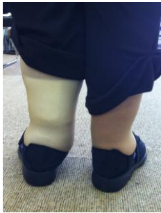
Pulman as an interim shoe