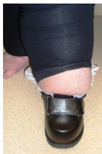
Shoes before therapy