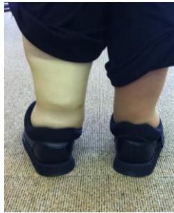
Mt Emey Accomodator as an option – DB 1 st choice but!