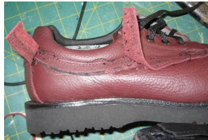
Lowering under the ankle