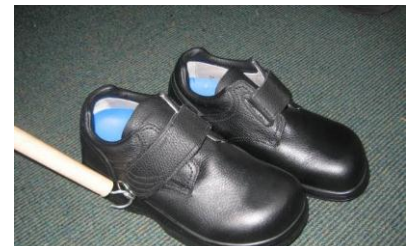
Hook and loop closures