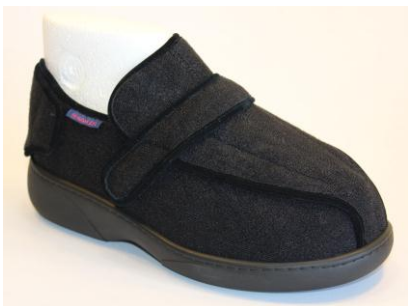
Classic Extra 2