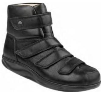
Preventative long opening