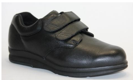
Leisure Time DX2