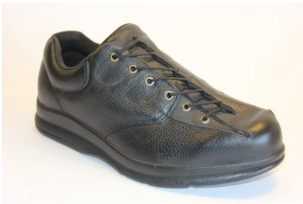
Conversion to long opening