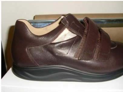
Lowering the topline