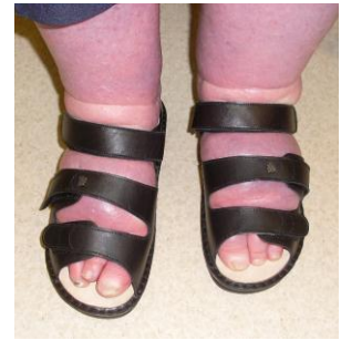
Finn sandals with the straps extended